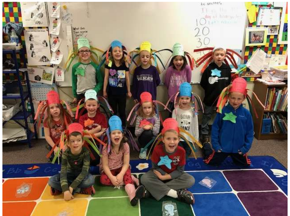
100 day hats

The 100th day of school was definitely memorable!