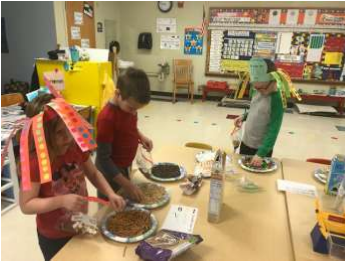
100 day snack construction

Hi-ho, Hi-ho, 100 days ago, we came to school we are so cool!