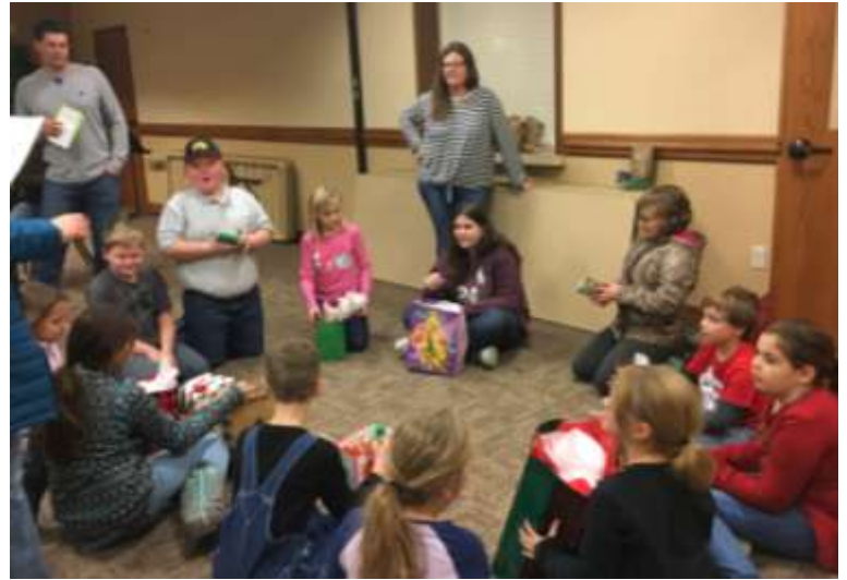
Club members enjoying their Gift Exchange at the December meeting.