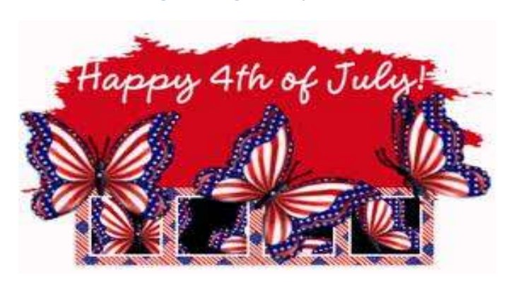
From the Residents & Staff