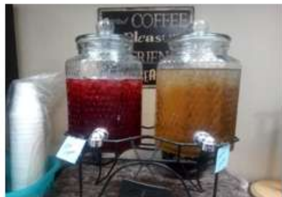
Blue Lagoon & Joshua's Blend Teas

Residents and staff celebrated National Iced Tea Week, August 10 to 14 th . We enjoyed different teas from the Chelmsford Tea Shop in Whitewater.