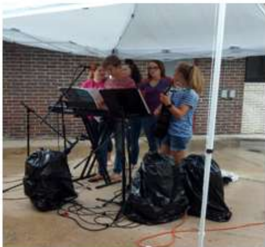
Heirbourne Youth sing to residents in the rain

Furley UMC invited Wheat State to participate in A Week of Intentional Prayer during August 2-9 th . Residents were asked to sign up for a time to pray specifically for our churches and communities. Edna is 99 years old.