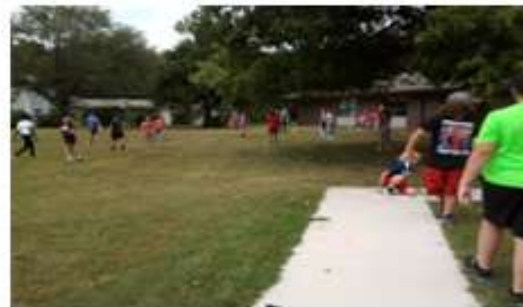
RMS 6th grade playing football