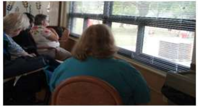
Residents enjoy a 6th grade football game in the yard