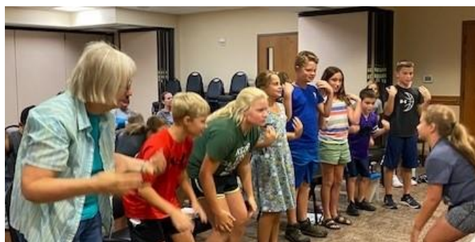
The club singing Head, Shoulders, Knees, and Toes