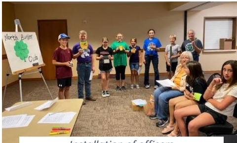
Installation of officers